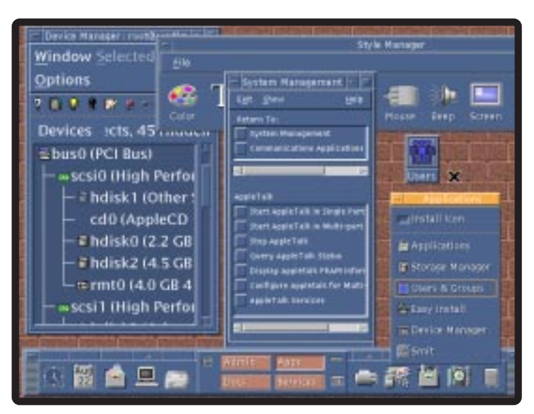
Easy-to-use tools minimize system administration.